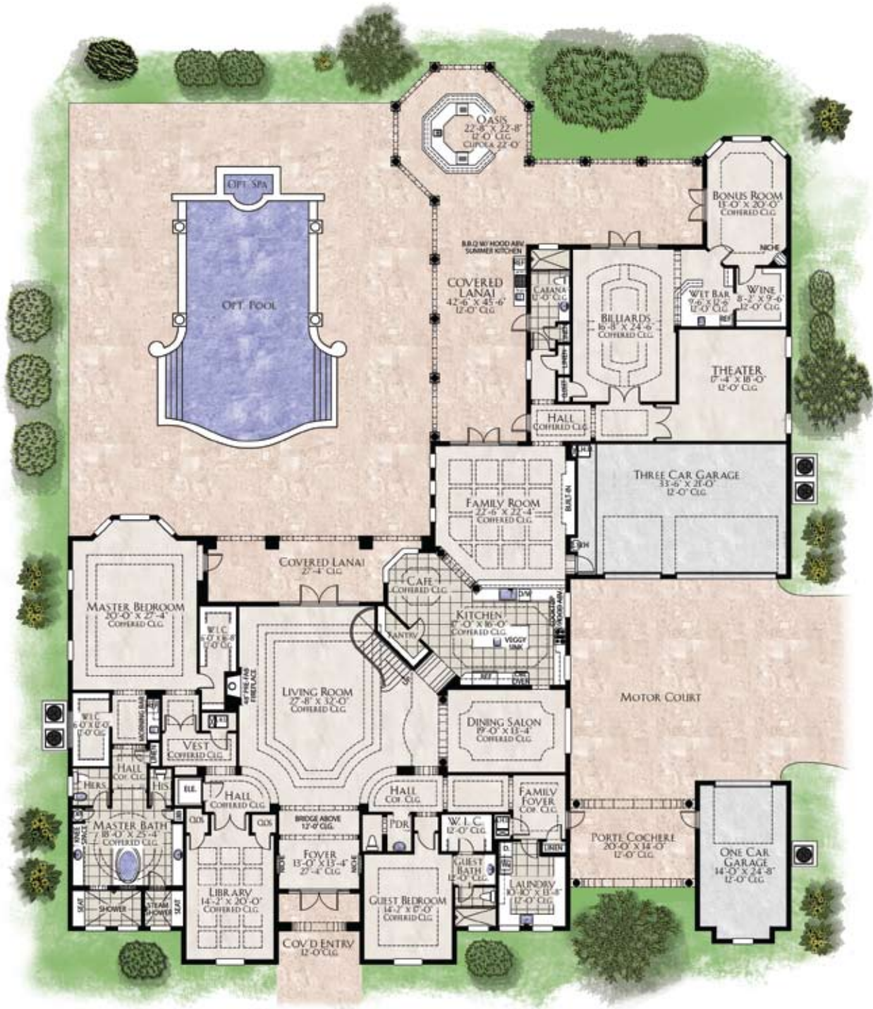
Artist Rendering. Dimensions and features are subject to change.